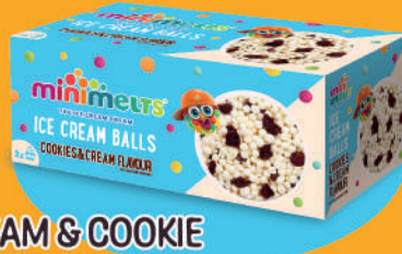
CREAM & COOKIE