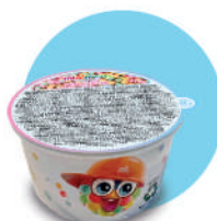
PAPER CUP (WITH WOODEN SPOON INSIDE)