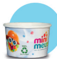
PAPER CUP 60g & 80g