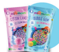
POUGH 70 G