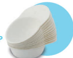
ECO BASEBALL CAP